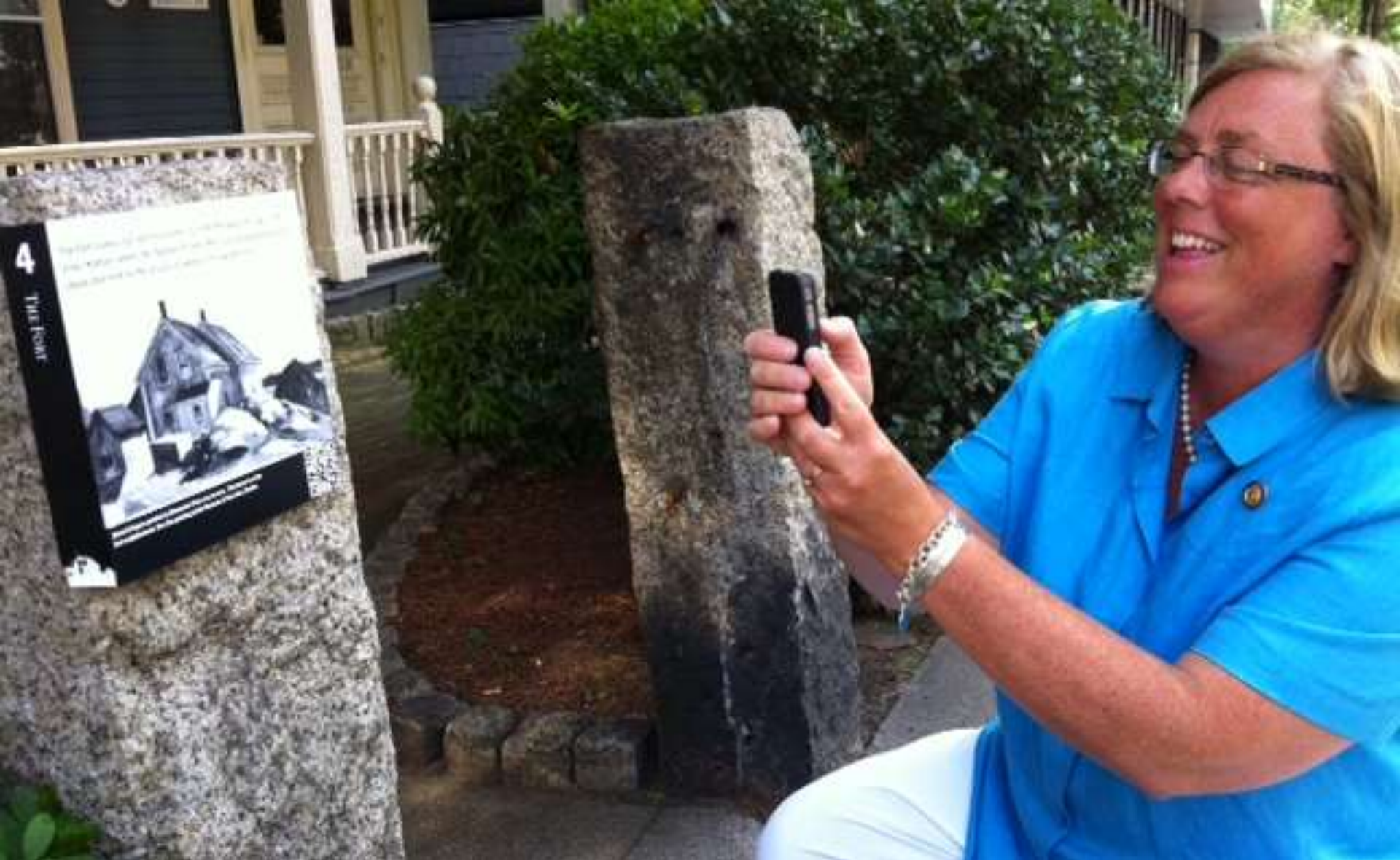
Scanning a QR code