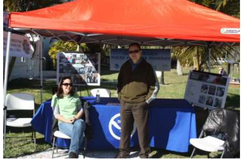
Project booth at Cortez Commercial Fishing Festival