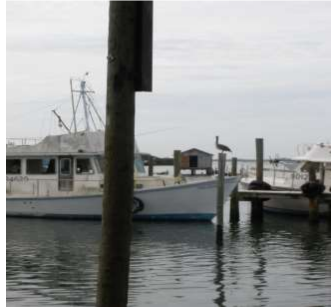
Vessels in Cortez, FL