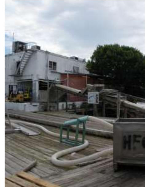
Fish house in Cortez