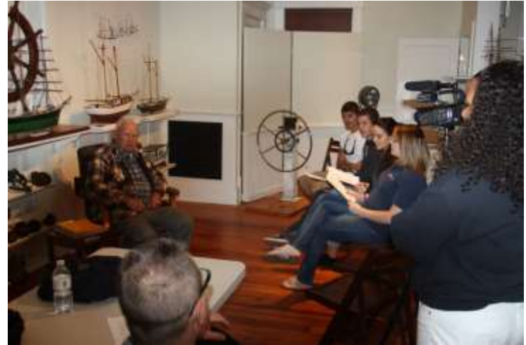
Students conducting interview with fisherman