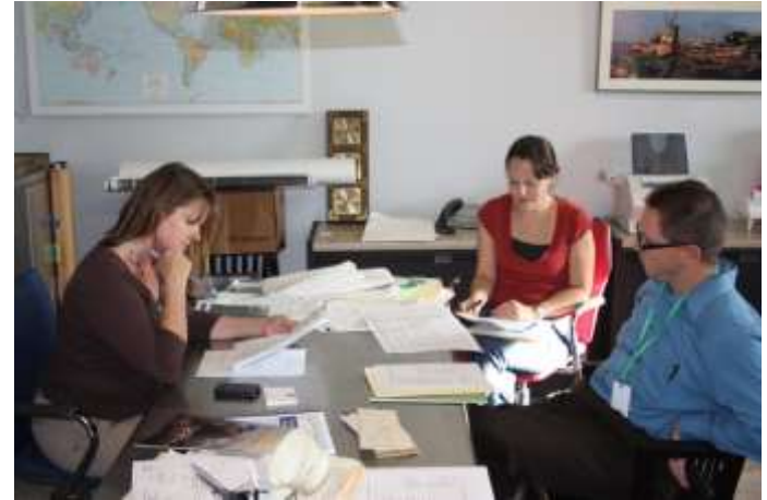
Community partner meeting in Cortez