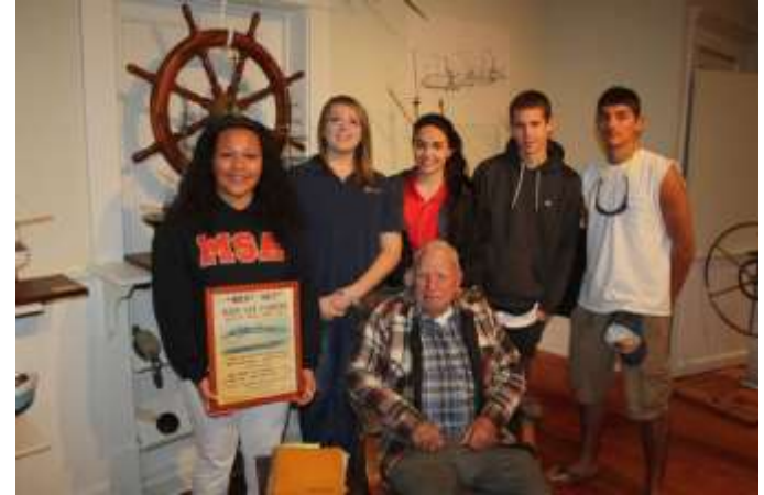
Students with interviewee