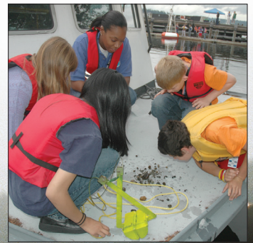
Left: A marine sunset at Fishermen's terminal in Seattle; Right: Students learning in the field

From tribal fishermen to commercial oyster farmers, seafood harvesting and consumption is a vital part of Pacific Northwest culture, diet and commerce. However, local seafood industries and consumers are confronted with difficult issues such as diminishing stocks, limited local retail opportunities, complex regulations and the inherent dangers of commercial fishing. WSG facilitates sustainable use of living marine resources through science-based and Indigenous knowledge-based management and workforce development.