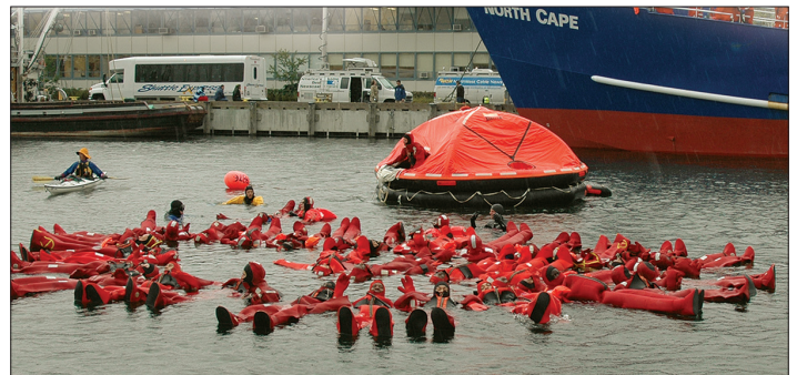
Students in a WSG sea safety class practice using survival suits

Current and future climate change impacts each of WSG's program areas; addressing these impacts is essential to meeting WSG's goals. WSG pursues strategies to further climate change mitigation, adaptation and resilience across the human and ecological communities along the shorelines and coasts of Washington State.