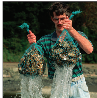
Clockwise: Lime Kiln Lighthouse on San Juan Island; digging for razor clams; a shellfish grower harvests oysters; the Elwha River