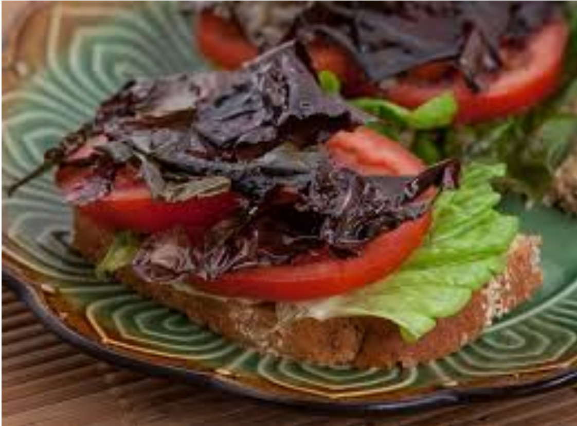
Whole Piece Kelp