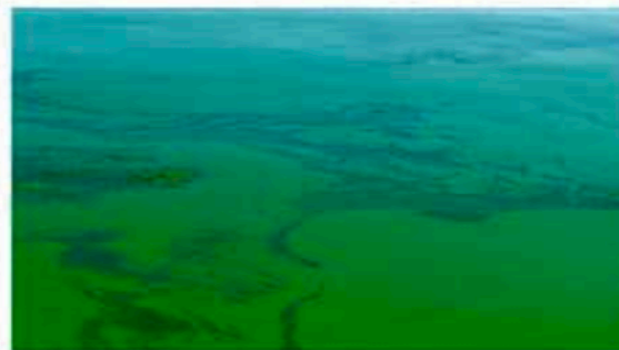
BLUE-GREEN ALGAE spirulina, chlorella