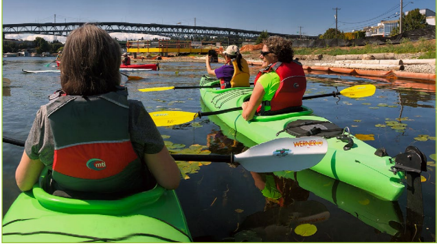
2019 WSG Staff