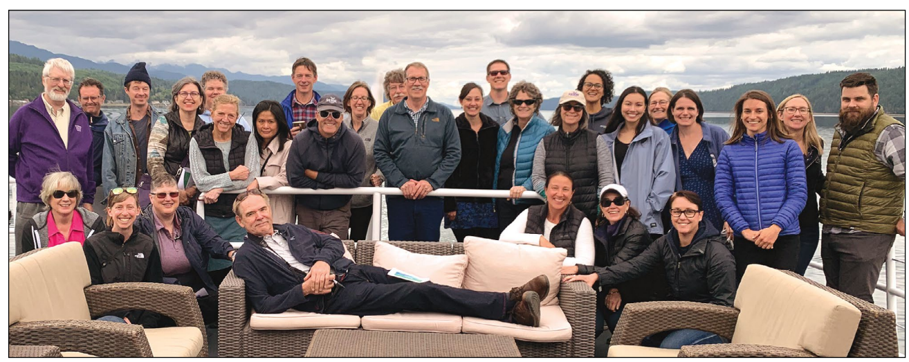
2019 WSG Staff