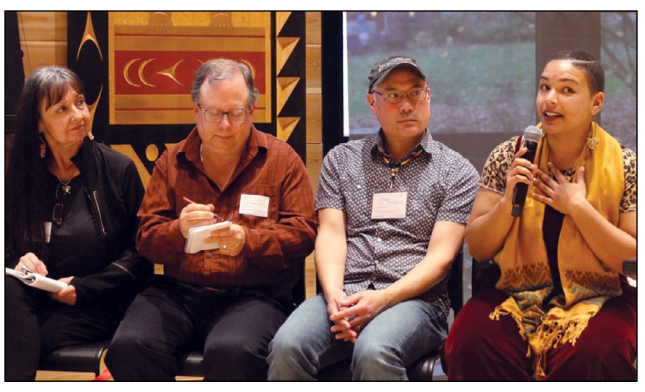
SSEC Panel - panelists speaking at the Salish Sea Equity and Justice Symposium in November 2019.