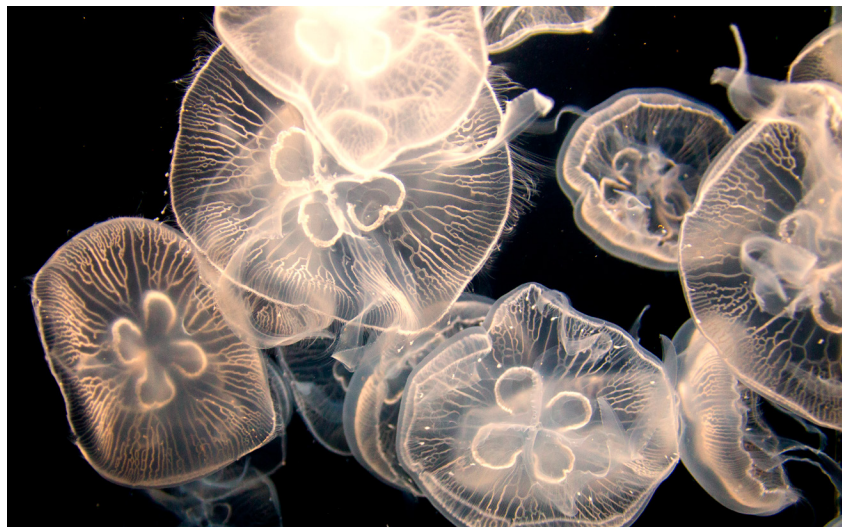
Closeup view of moon jellyfish ( Aurelia labiata ) drifting with the current.

“Jellyfish are not necessarily bad, but we want to keep an eye on them to see what their potential effects could be,” Schultz says. 🌱