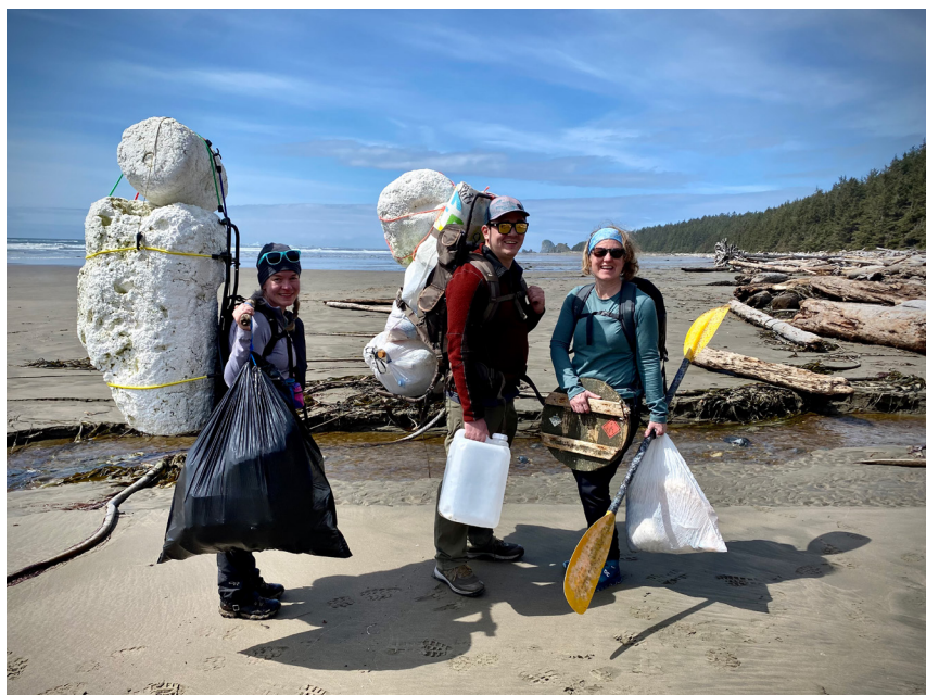
Volunteers at last year's Washington Coast Cleanup.