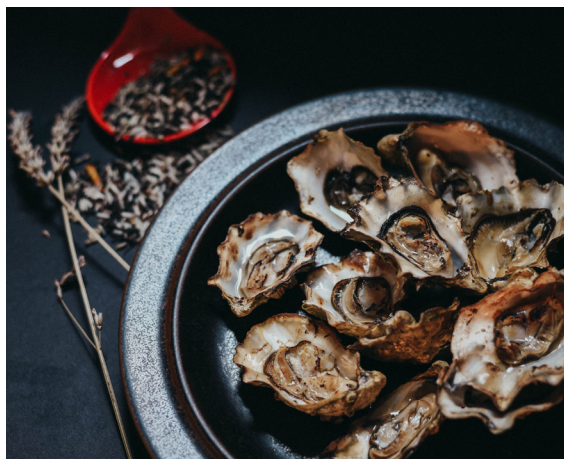
One of the recipes included in the book is for teak smoked Sequim Bay oysters with lavender, provided by Jamestown Seafoods of the Jamestown S'Klallam Tribe.

the J.J. Brenner Oyster Company, which is the oldest continuously operating oyster enterprise on Puget Sound.