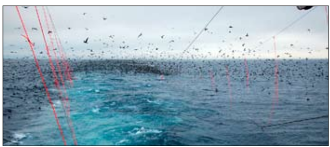
Paired streamer lines while trawling

Pilot testing of seabird deterrent technologies was initiated to reduce seabird interactions with trawl cables in the Bering Sea catcher-processor fleet. With NOAA Fisheries funding, two vessels were retrofitted in 2005, based on WSGP recommendations, and WSGP expanded research on retrofitted vessels.