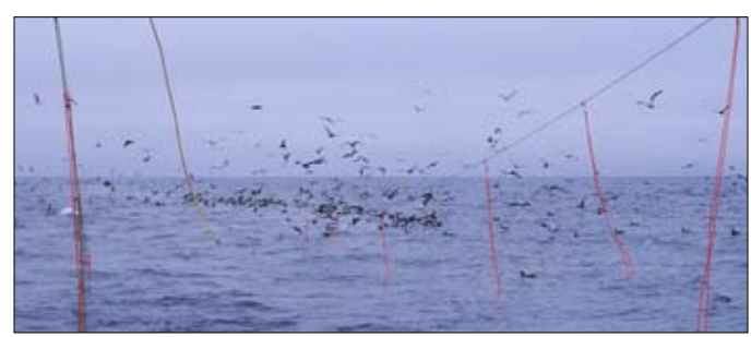
Paired streamer lines while setting longline gear.

A new, lighter streamer line was developed in collaboration with the Alaska Sea Grant Program and is being distributed to the small boat fleet throughout Alaska.