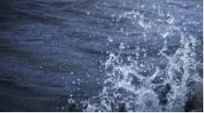
Teen dies after divers pull him out of Spanaway Lake