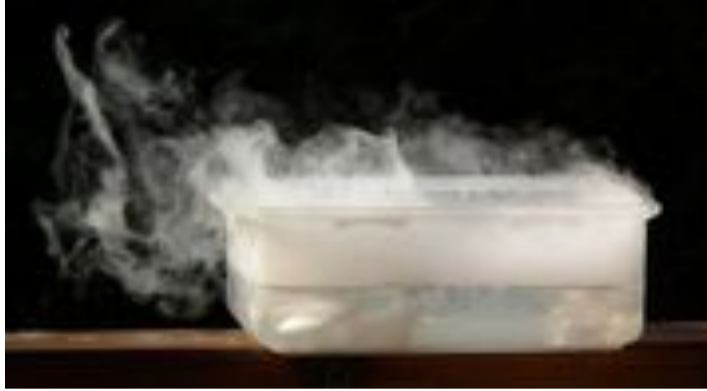
Death by dry ice: Coolers stored in car lead to 'horrific accident'

Scientists with Washington Sea Grant and the University of Washington Climate Impacts Group calculated the likelihood that sea levels will reach or exceed a certain level for each