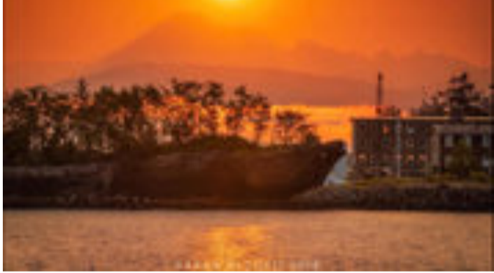
FORECAST: Hot Again Monday