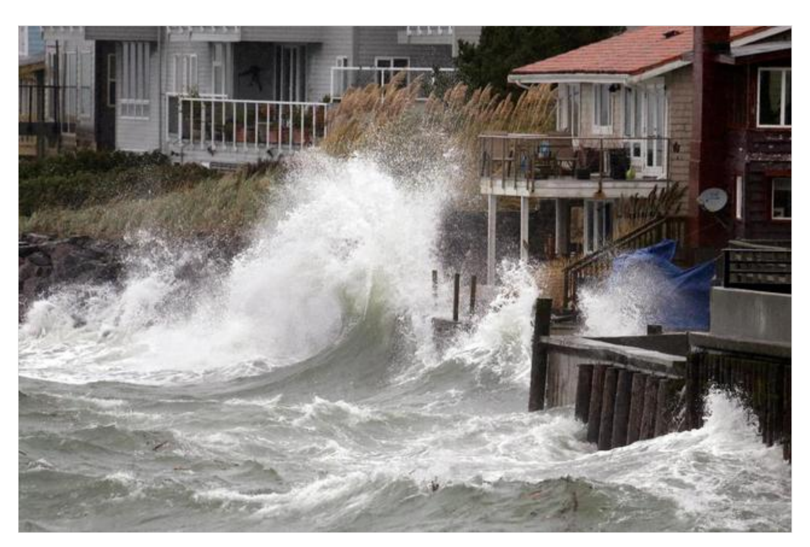
FILE - In this Nov. 17, 2015, file photo, wind-blown waves from the Puget Sound batter houses in Seattle. A new report released Monday, July 30, 2018, provides the most detailed projections for how fast sea levels are expected to rise along Washington state shorelines over the next decades.